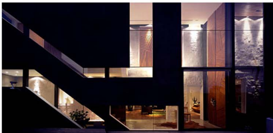
Ant Farm House